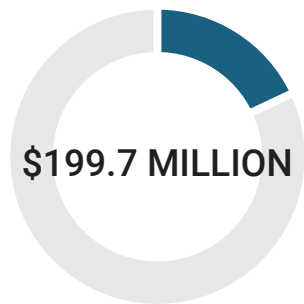
BULK GRAIN PRODUCTS