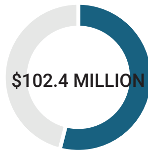
OTHER VALUE ADDED AG & FOOD PRODUCTS