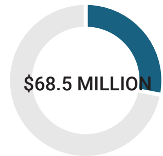
MEAT & ANIMAL PRODUCTS